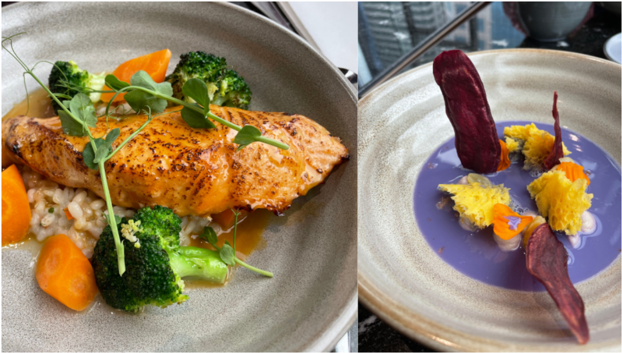
R: Roasted Atlantic Salmon L: Hot & Cold Orh Nee

It would be a pity, though, if you don't explore the surroundings, as the nearby Chinatown, Telok Ayer, Tanjong Pagar Road offer more food choices than you may have the tummy for!