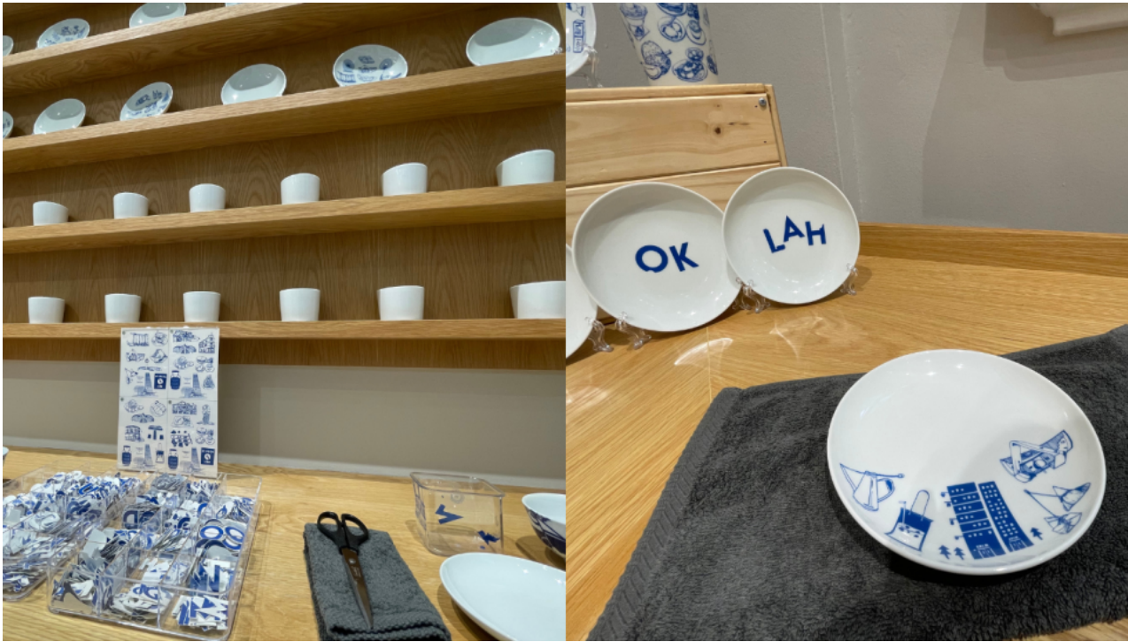
Supermama Bento Workshop

On top of that, hotel guests are also entitled to discounted prices for certain tours and experiences to make the stay more memorable, such as: