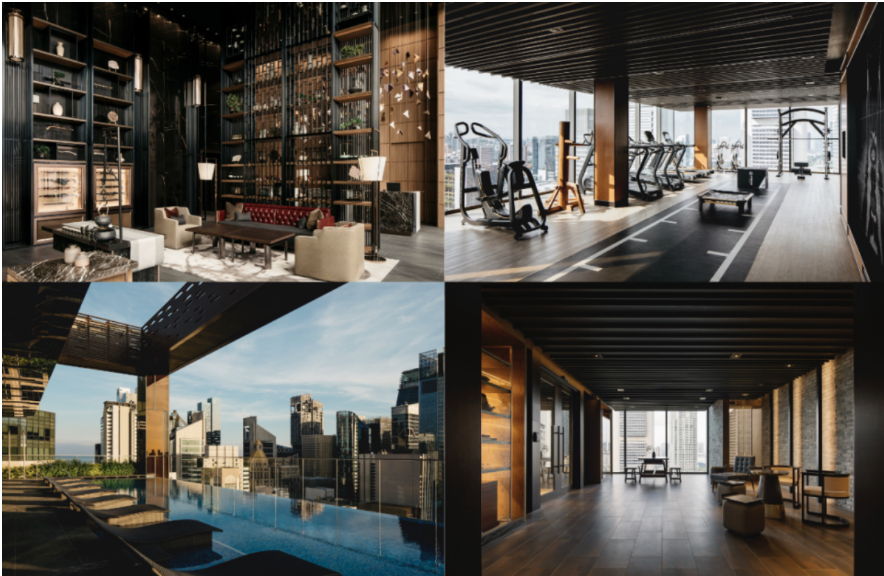
Top right to bottom: Welcome lobby, Gym, Pool, Lounge

Everywhere you turn, experience a soothing atmosphere with browns and black, large windows to let natural lights in, and warm illuminations. Especially with the Premier rooms, you'll get two large windows giving you a 180-degree view of Singapore's skyline.