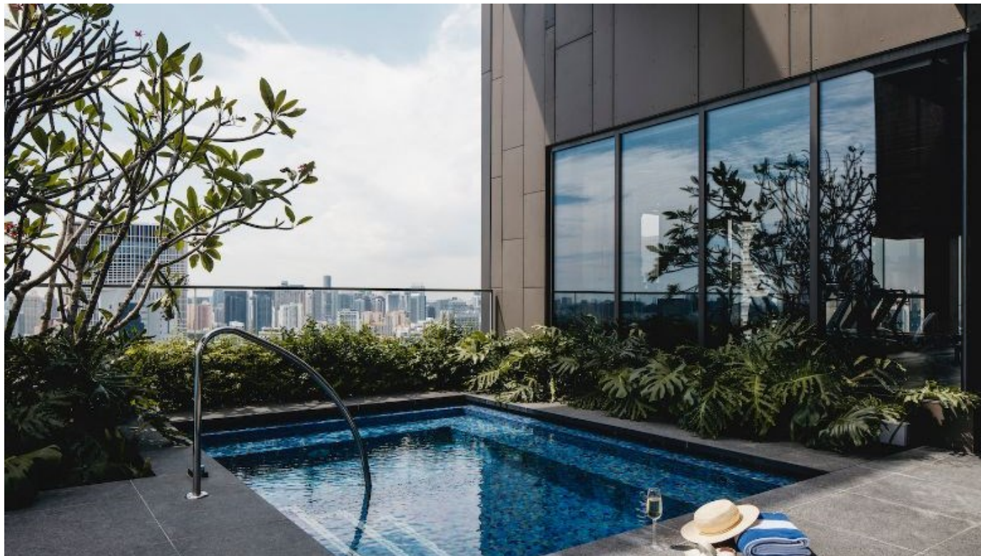
The topmost 30th floor sits the Sky Pool and jacuzzi, which overlooks the Far East Square heritage precinct and Telok Ayer district.

Each guest of the Master Series rooms will have the option of an in-room check-in experience along with a personalised orientation of the hotel; an all-day breakfast spread that can be enjoyed in-room or at the hotel restaurant; luxurious bath amenities in-room with a selection of essential oils and aromatic salts; a distinct turndown service; as well as access to personal concierge services provided by The Clan Keepers, including personalised shopping and a local precinct tour; among others.