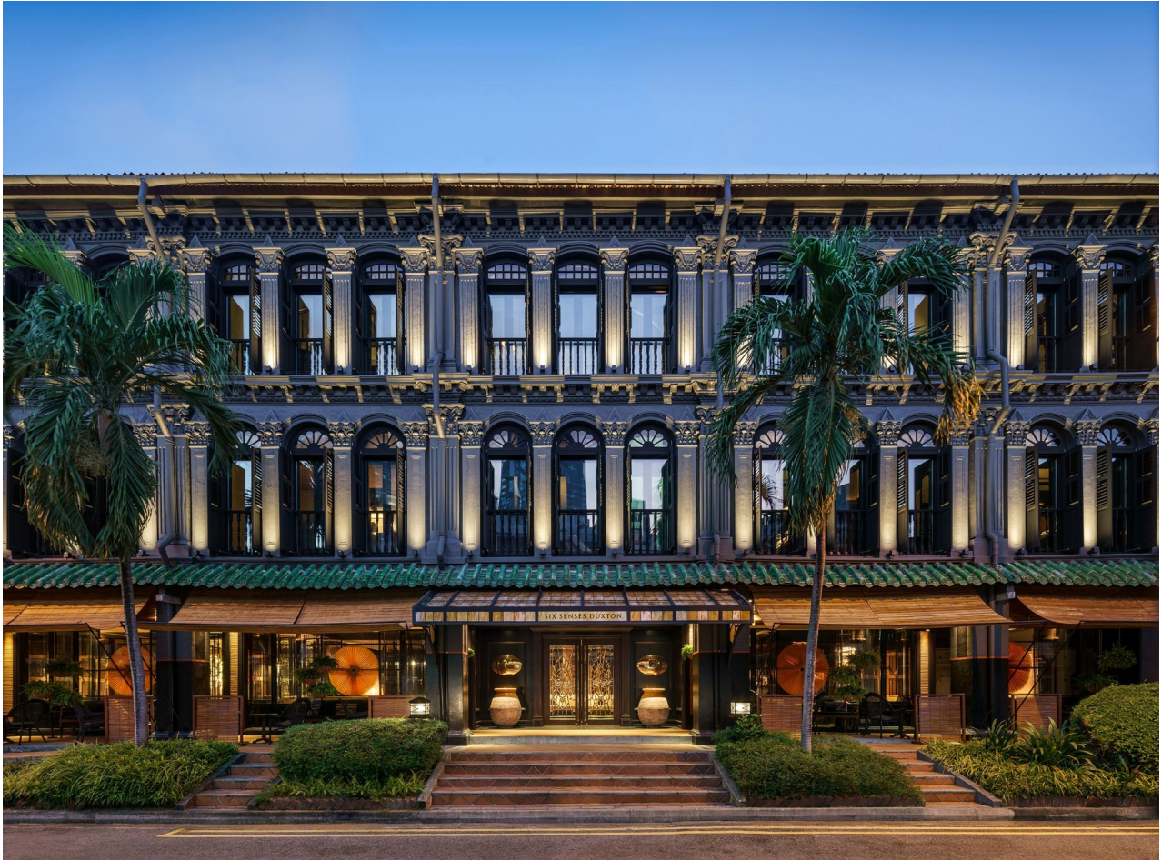
The shophouse exterior

The hotel's luxurious compound holds 198 stylish rooms and suites. Each room is a serene sanctuary, with refined motifs and carpet prints serving as subtle references to the resort's Thai heritage. The bigger suites feature outdoor bathtubs for invigorating soaks and terraces with panoramic views.