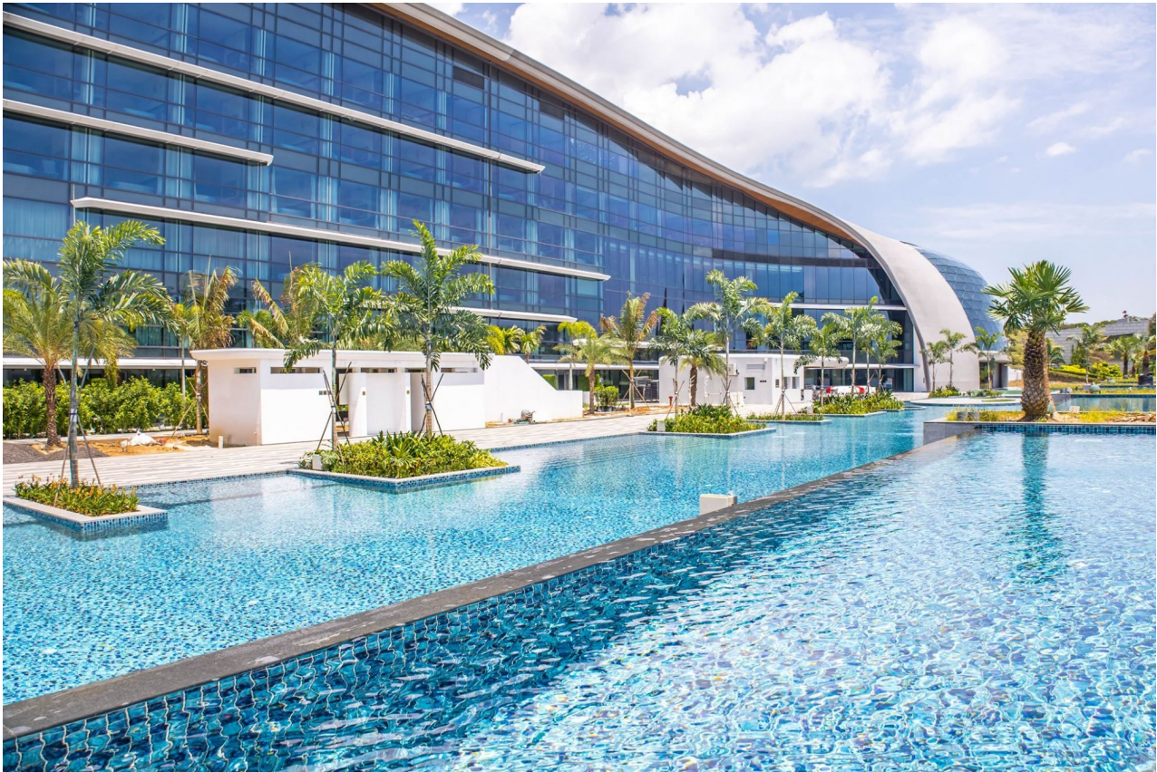
Swimming area at the Dusit Thani Laguna Singapore resort