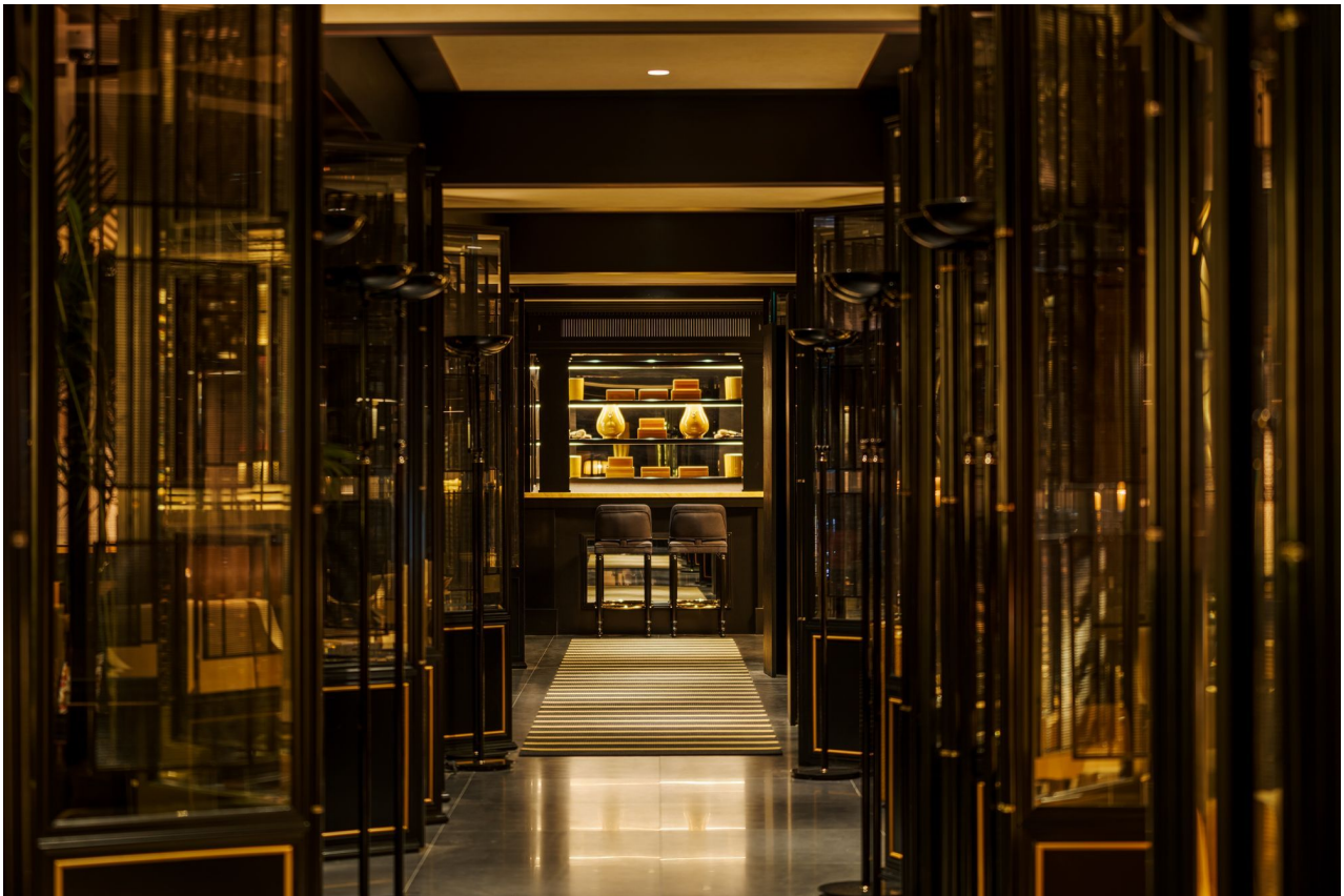
The reception area

Occupying eight restored 19th-century shophouses, the hotel has retained its glamorous interiors designed by Anouska Hempel and Jacques Garcia .