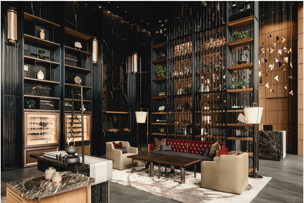
Lobby Area