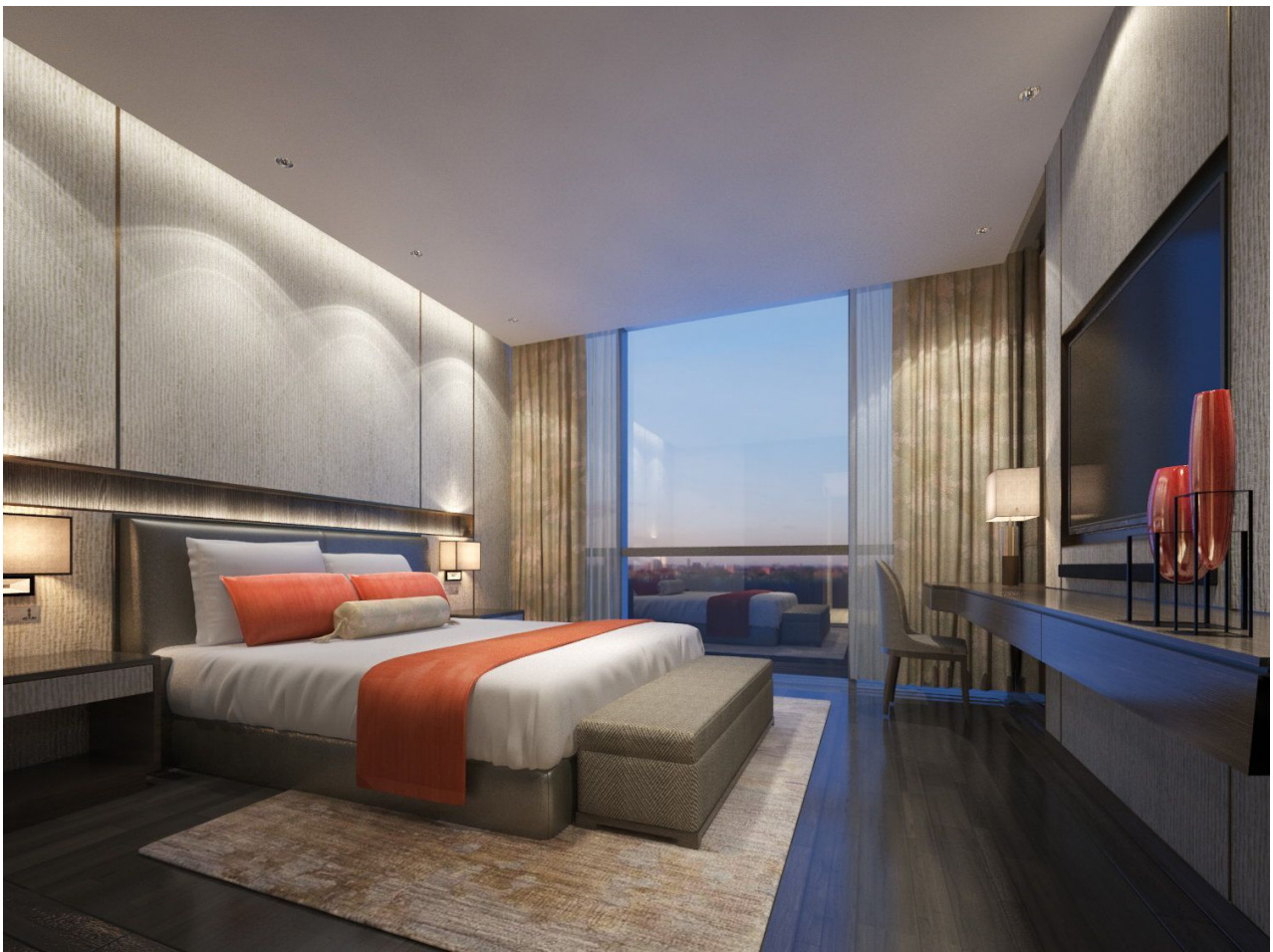
Dusit Executive Club room