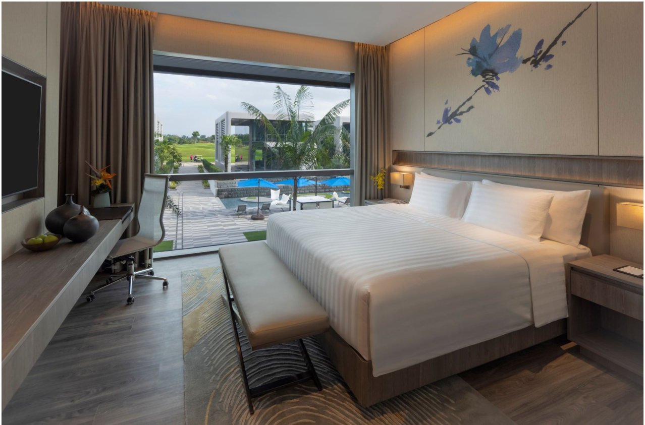
Deluxe Laguna Pool View room