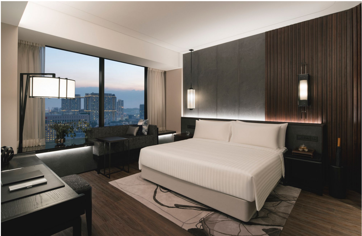
The Grand Premier Room

Rich with culture and personality, the hotel is both stylish and charming with its thoughtful cues to its neighbourhood. Heritage details and cultural artifacts can be found throughout, ranging from Chinese tea sets in the lobby to contemporary oriental lamps in individual rooms. These are curated and contributed by The Clan Collective, a group consisting of local craftsmen as well as cultural curators.