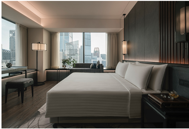
The Grand Premier room

Aside from the scenic rooftop pool on the 30th floor, the best views in the house can be found from one of the 18 exclusive Grand Premier rooms. This is the one to book if you're looking to truly treat yourself—everything from the furnishings to the bathtub tucked away in the compact yet spacious toilet feels elevated and luxe. Every room, regardless of category, comes equipped with a work desk and a sprawling bed but best of all are the bay windows to perch on for a languid evening of sky-gazing. The widescreen TV mounted on the wall gives you several options—you can tune in to local channels, Chromecast your favourite shows on Netflix, and even order all of your room service and housekeeping needs directly from the screen.