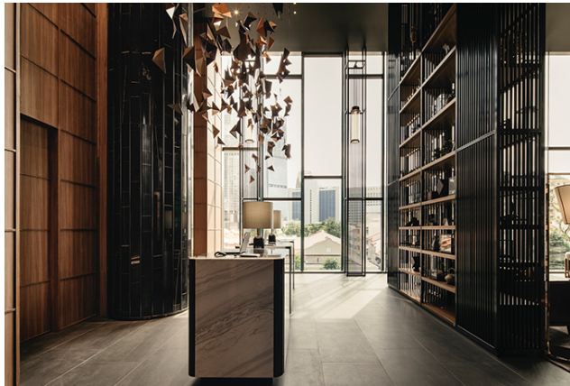
The Clan Hotel lobby and reception

The rooms are wrapped around the central skeleton of the building, which is immediately evident when you step into one and take in the 270 degree vistas of Chinatown and Telok Ayer the expansive windows offer. The juxtaposition between the shophouses dotting the streets below and the skyscrapers on the horizon exemplifies the intersection on which the Clan Hotel operates: between modern-day Singapore and Singapore past. For travellers unacquainted with Singapore, it's the perfect spot to get a glimpse into our culture. And for those of us who have spent our entire lives here—chances are, you'll learn something new without even having to leave the property.