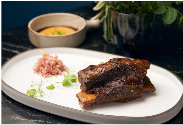
The Short Rib at QĪN Restaurant

Dinner time might see you wander into the hotel’s signature eatery—QĪN. Designed to be an all-day dining concept, this double-storey restaurant and bar serves up reimagined Asian classics like Siphon Mushroom Tea, Chilled Crab Salad and ‘ San Mein ’, alongside an extensive 60-bottle wine collection. If you are craving more quintessentially Singaporean flavours, call for in-room dining. What you’ll receive is a carefully curated meal crafted in collaboration with Singaporean hawkers known as the Clan Daily Special, featuring dishes like Bak Kut Teh and Laksa .