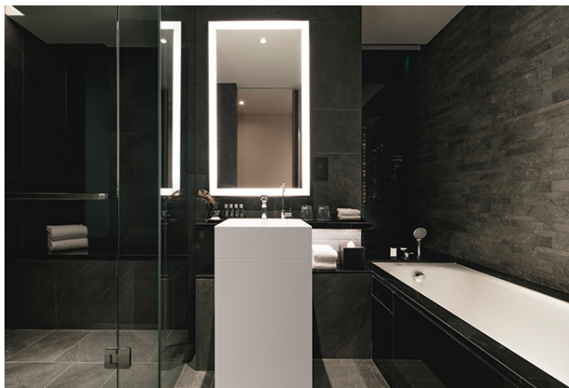
The bathroom in the Grand Premier room

Dinner time might see you wander into the hotel’s signature eatery—QĪN. Designed to be an all-day dining concept, this double-storey restaurant and bar serves up reimagined Asian classics like Siphon Mushroom Tea, Chilled Crab Salad and ‘ San Mein ’, alongside an extensive 60-bottle wine collection. If you are craving more quintessentially Singaporean flavours, call for in-room dining. What you’ll receive is a carefully curated meal crafted in collaboration with Singaporean hawkers known as the Clan Daily Special, featuring dishes like Bak Kut Teh and Laksa .