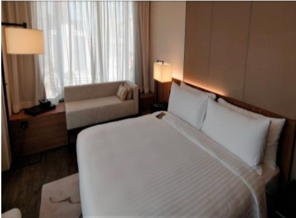
Our cozy Premier Room

There are three classes of rooms. The 36sqm Grand Premier Rooms have a sumptuous king size bed and a bathtub. The Premier Rooms, where we stayed, are a most comfortable 31sqm. With extensive power points and a desk, it is an easy place to work from – if you must. The 246 24sqm Deluxe Rooms are perfect for those whose focus is on work. They are styled for serenity and this amply spaced retreat is a pragmatic choice for the business traveller.