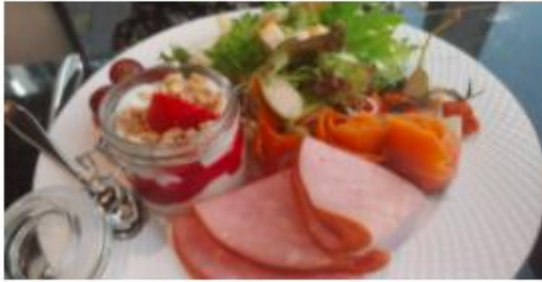
Breakfast at QIN - Right the Continental Breakfast

QIN offers an all-day dining concept by TungLok Group. The cosmopolitan restaurant was inspired by Asian cuisine and it serves an array of re-imagined classics with a modern touch. Offerings include Chili Crab Crostini and ' Sang Mein ' - noodles that originated in Hong Kong . Diners can also extend the night at the bar on the mezzanine floor with a nightcap selected from a menu featuring a range of cocktails and over 60 types of wine. QIN is already becoming a popular venue for business lunches.