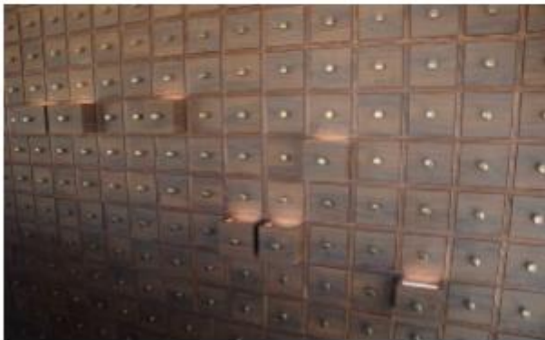
The Master of Tea (left) QIN Restaurant and Bar (above)