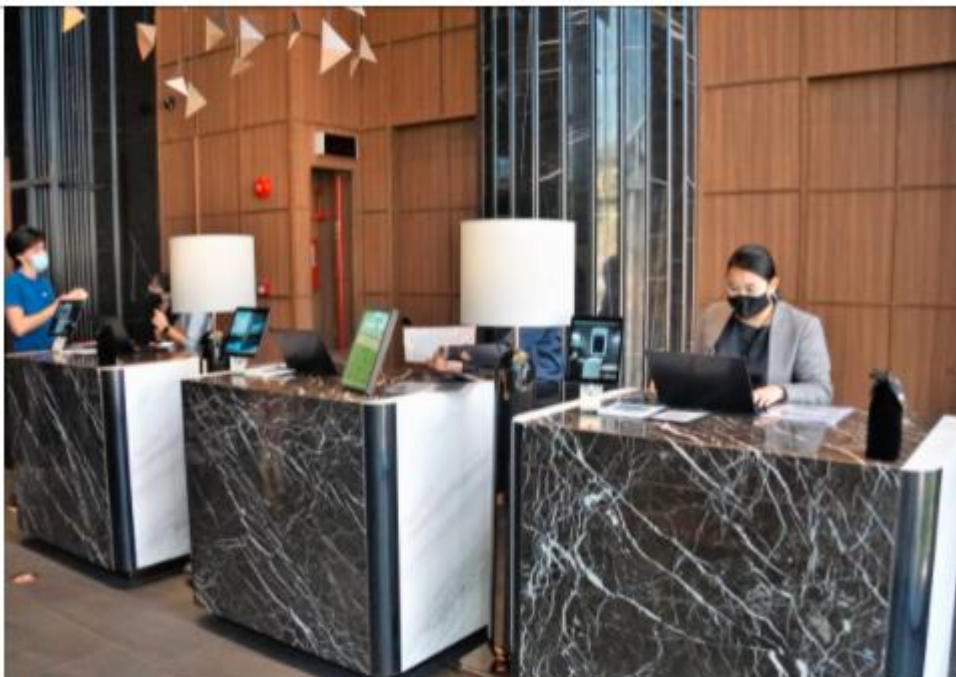
Lobby of The Clan Hotel Singapore

The umbrella is symbolic of what the clans did in their day and the mission of The Clan Hotel Singapore today. While the needs of today’s travellers are much more complex than those who first came ashore here, the The Clan Hotel is dedicated to ensuring their guests are fully looked after. The hotel anticipates what a business traveller could require while those seeking a relaxing staycation it offers all the luxury and services for a much-needed break.