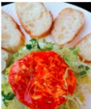
QIN serves a large delicious lunch

QIN offers an all-day dining concept by TungLok Group. The cosmopolitan restaurant was inspired by Asian cuisine and it serves an array of re-imagined classics with a modern touch. Offerings include Chili Crab Crostini and ' Sang Mein ' - noodles that originated in Hong Kong . Diners can also extend the night at the bar on the mezzanine floor with a nightcap selected from a menu featuring a range of cocktails and over 60 types of wine. QIN is already becoming a popular venue for business lunches.