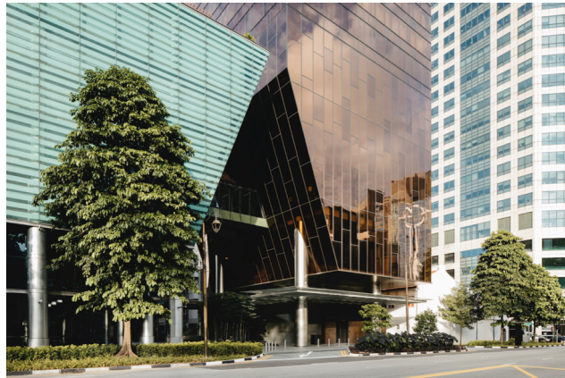
The Clan Hotel's discreet façade

A stay at the 324-room property, which is located in the middle of the Far East Square heritage precinct and the Telok Ayer district, almost feels like going through a portal to a new yet familiar place. From a distance, the copper glass-clad skyscraper looms above the neighborhood, but up close, it is quiet and discreet — no grand driveways or entrances, just an unassuming doorway that will lead you to a world of new experiences.