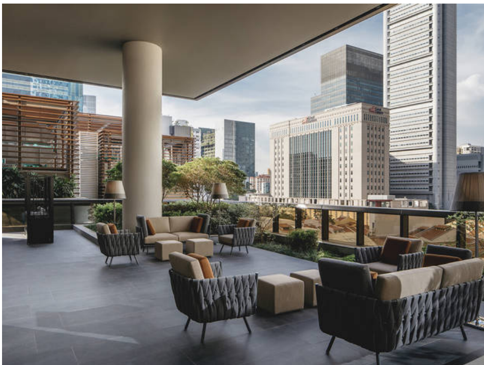
Photograph: The Clan Hotel