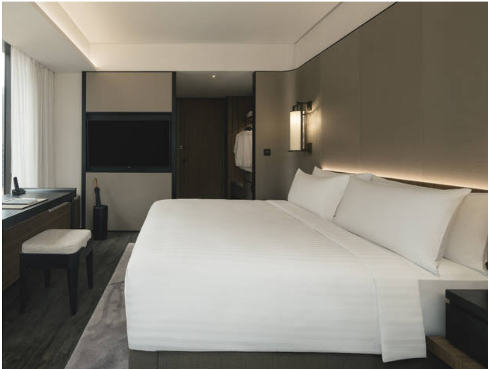
Photograph: The Clan Hotel