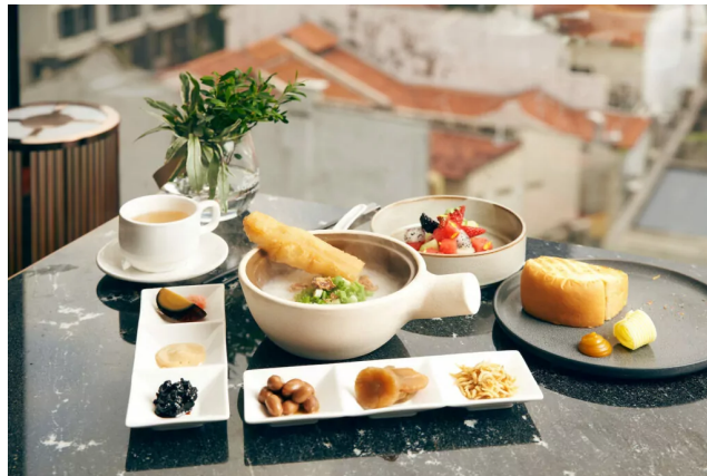
QĪN Restaurant_Home Brewed Local Porridge Set

With my mouth still watering over the satay, our turn down service arrived and we were left with a relaxing Blooming tea and a ‘goodnight essential oil’ to ensure a restful night of sleep ahead.