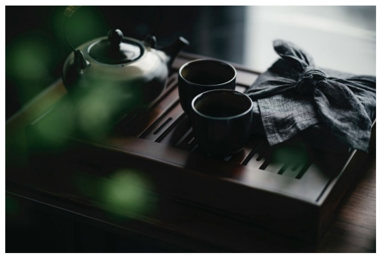
The 324-room property features signature MASTER Series rooms comprising 18 Grand Premier and 60 Premier rooms.

Not to mention The Inner Circle Guide, where guests can flash their room card at partnering dining and entertainment merchants for perks. Oh, and the Sky Pool fitted with semi-submerged lounge chairs to sink back and admire the city panorama. Our only gripe? The misleading names of The Den and Mahjong Room, which are simply meeting rooms with nary of a game table to be seen.