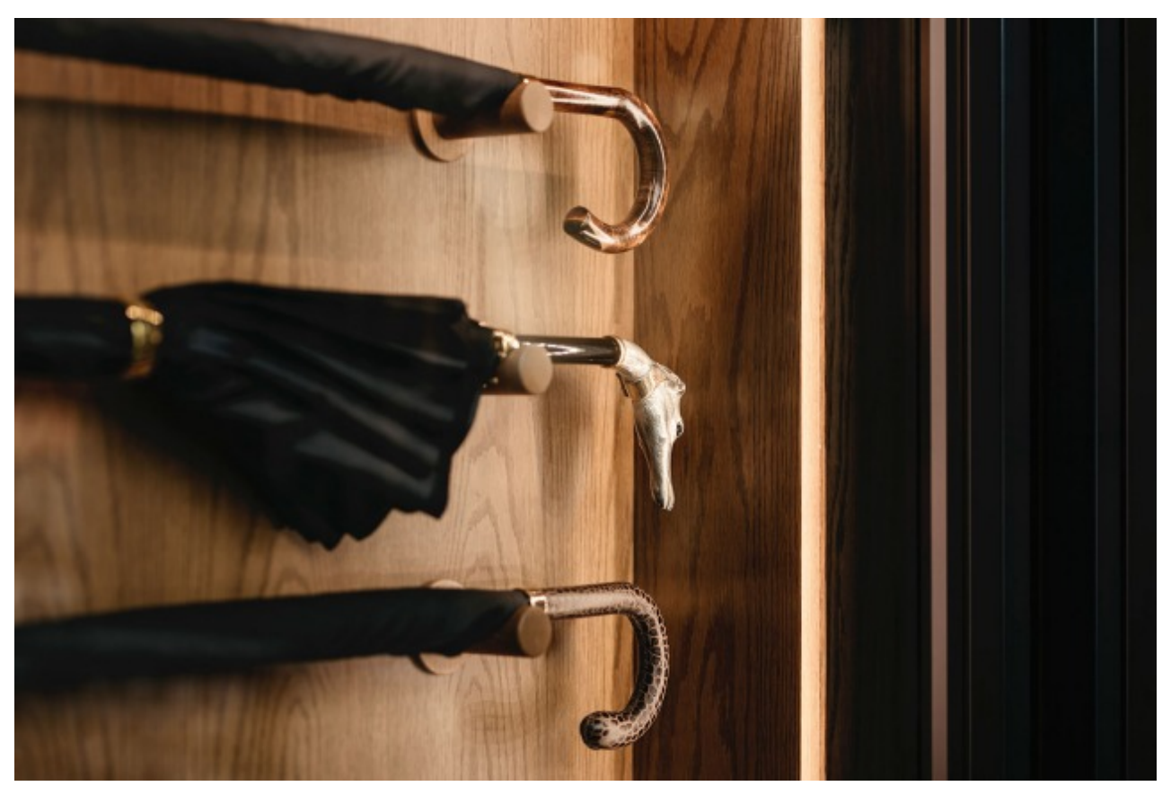
The umbrella collection represents the brand's commitment to provide familial refuge for guests.

For starters, corner window views of the central business district, all-day breakfast with the option to enjoy it in-room, using the petite bathtub to the fullest with a selection of aromatic bath salts, and a turndown service—nighttime essential oil and, hey, more tea. Plus, your own teapot set to brew it in. You know, the little things.