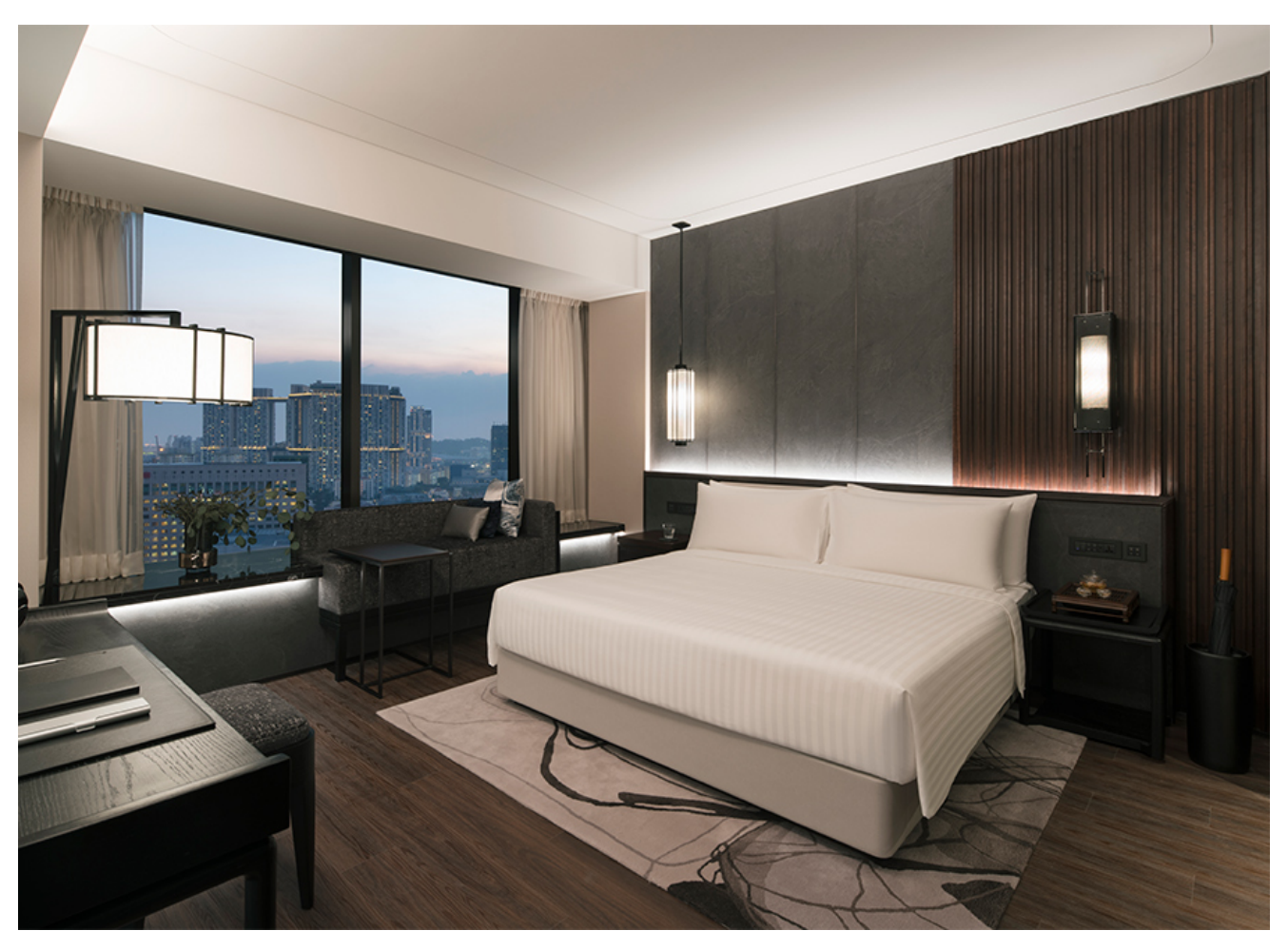
Lisa's luxurious Grand Premier Room at Singapore's well-situated Clan Hotel.

These streets were once lined with bustling shophouses, while wooden boats known as sampans floated along the water.