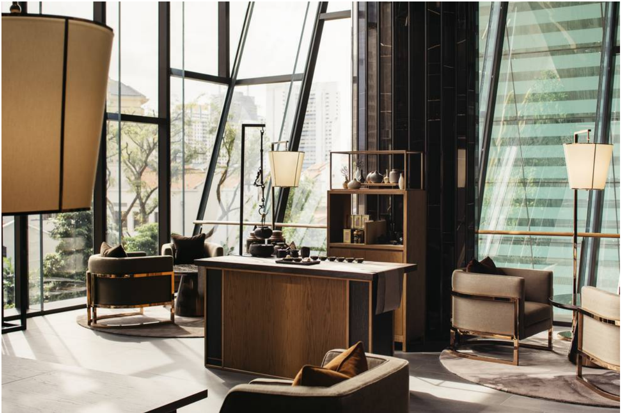
Check-in at Singapore's The Clan Hotel involves a welcoming tea ceremony.

Check-in experience: Our black and brown lift opens to double-height reception with a wall of floor-to-ceiling windows where dietary preferences are confirmed and check-in is smooth. We are then invited beyond a soaring screen to a welcoming tea ceremony. We are also assigned a personal Clan Keeper who will answer all queries, organise a guided walking tour of the neighbourhood if we want, have clothes pressed, shoes shined, anything we desire.