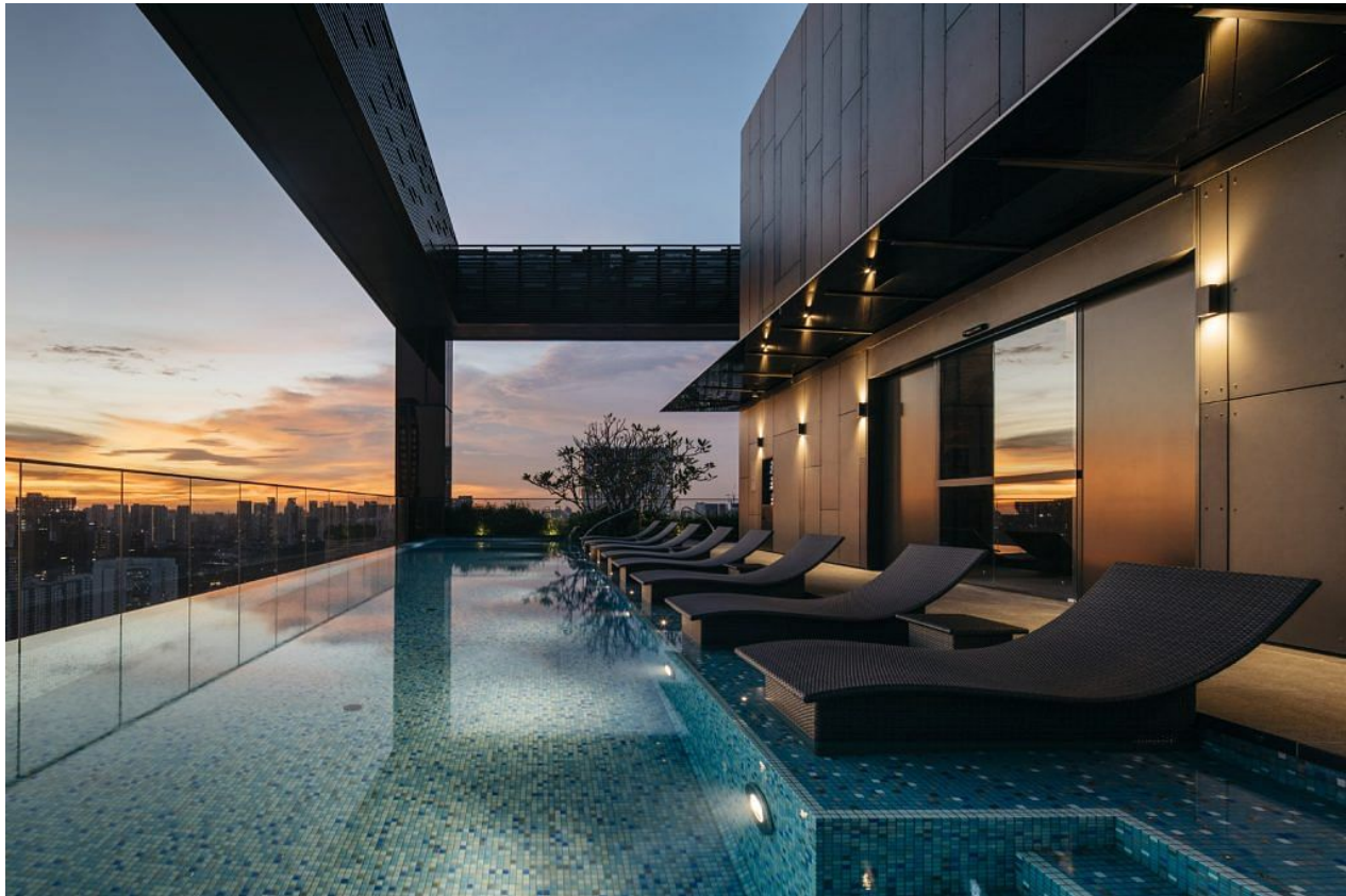
Enjoy the beautiful sunset at the Sky Pool, away from the hustle and bustle.

Should guests need a respite from their busy schedules, the rooms and suites at The Clan Hotel offer a opulent experience. Outfitted with ergonomic furniture and cutting-edge entertainment systems, these spaces are designed for optimal comfort, catering to your relaxation needs.