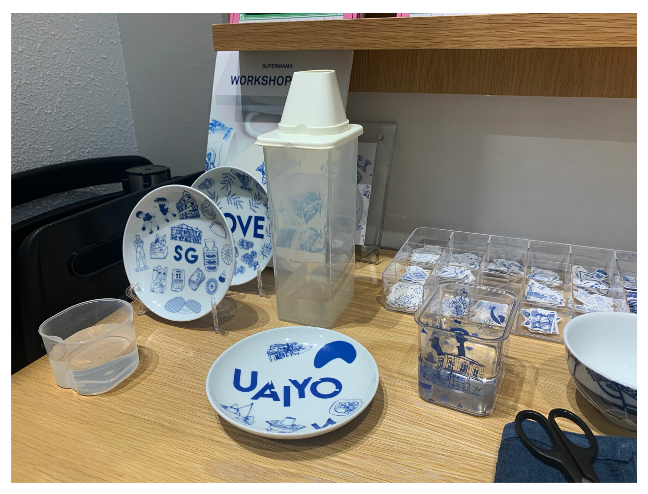
Supermama workshop

Round off your experience with a workshop where you can craft your own blue-and-white porcelain plate at Supermama, a local design and lifestyle store. Decorate your plate with a variety of vinyl motifs that encapsulate Singapore's culture, ranging from local cuisine to iconic landmarks. These plates will then be sent for firing, and you'll have the pleasure of taking home your own personalised piece of tableware.