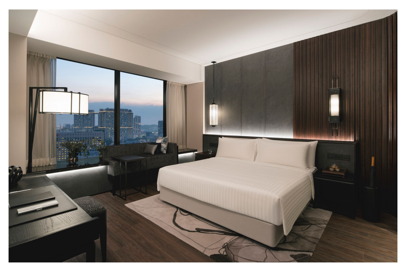
Above The Grand Premier Room

Rich with culture and personality, the hotel is both stylish and charming with its thoughtful cues to its neighbourhood. Heritage details and cultural artifacts can be found throughout, ranging from Chinese tea sets in the lobby to contemporary oriental lamps in individual rooms. These are curated and contributed by The Clan Collective, a group consisting of local craftsmen as well as cultural curators.